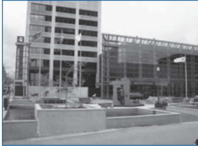
Quebec City Convention Centre, CCFL Meeting held here May 3-7, 2010